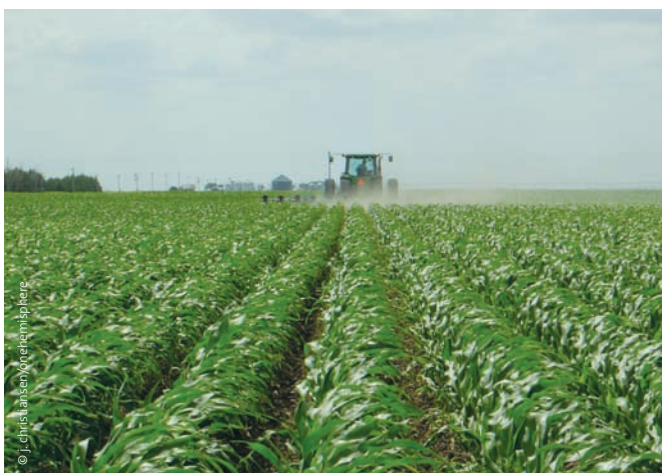
Bt Corn field, Nebraska.

Monsanto is also driving greater use of Roundup by incorporating the Roundup Ready trait in nearly every GM seed it sells. US farmers who once bought GM maize modified only to be resistant to insect pests (Bt crops) now find these varieties “stacked” with the Roundup Ready herbicide resistance trait as well. As a result, in the US, the area planted with Monsanto GM maize seed without the Roundup Ready trait fell dramatically from 25.3 million acres in 2004 to just 4.9 million acres in 2008. This “trait penetration” strategy means higher profits from both seeds and Roundup sales, and ensures farmers' dependence on GM traits and Roundup.